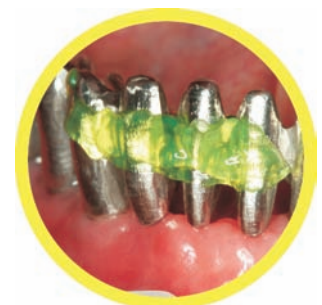
Metalstructure blocking in mouth