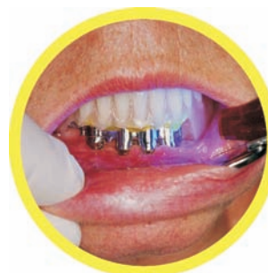
Quick light curing in mouth