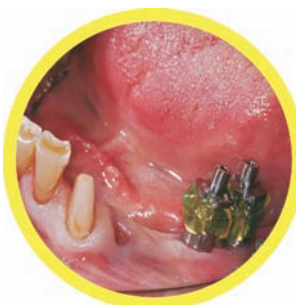
Extremely precise post construction in mouth