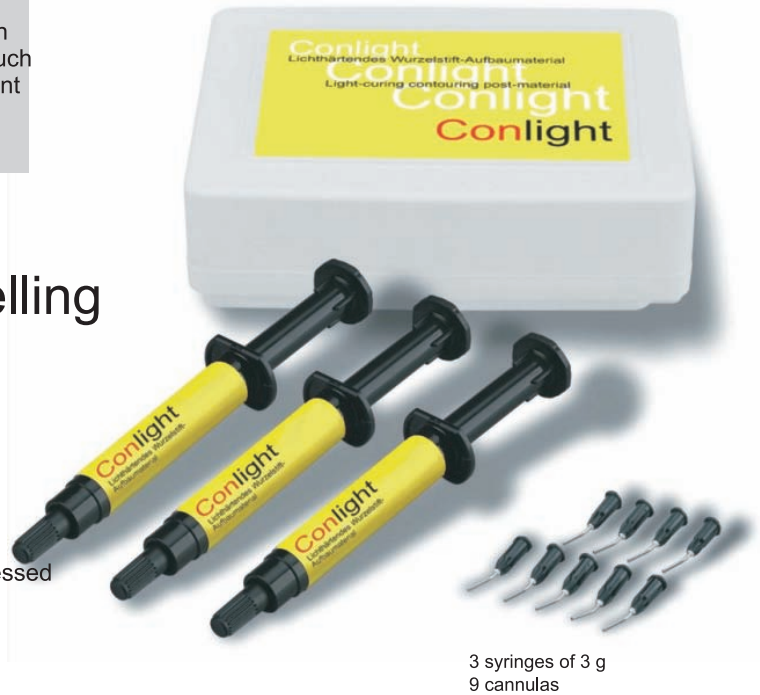
3 syringes of 3 g 9 cannulas