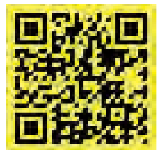
Scan the QR to see the video