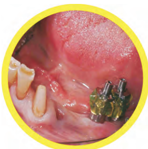
Extremely precise post construction in mouth