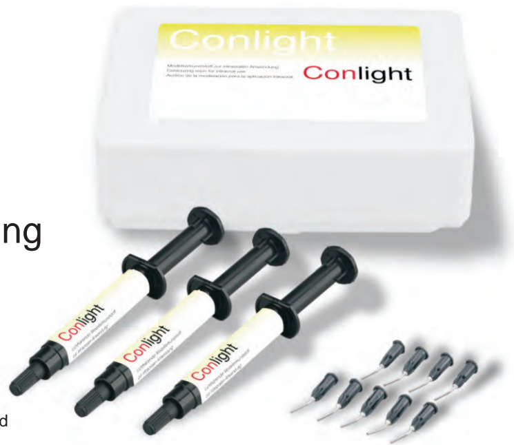
3 syringes of 3 g 9 cannulas